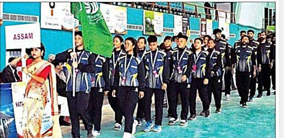
March past of Assam team in the opening ceremony

Earlier in the morning, the competition started with a colourful opening ceremony. The event was attended by Pijush Hazarika, Minister of Parliamentary Affairs, Water Resources, Information & Public Relations etc; Ashok Singhal,