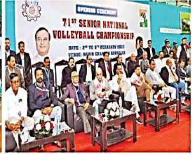
গুৱাহাটীৰ সৰুচান্দাৰ ইন্ডাৰ স্টেডিয়ামত আৰম্ভণিৰ পৰা আৰম্ভ হোৱা ৭১তম সংস্কৰ ছিনিয়ৰ ৰাষ্ট্ৰীয় ভলীবল প্ৰতিযোগিতাৰ উদ্বোধনী অনুষ্ঠানত মুহূৰ্ত, বৃহস্পতিবাৰে