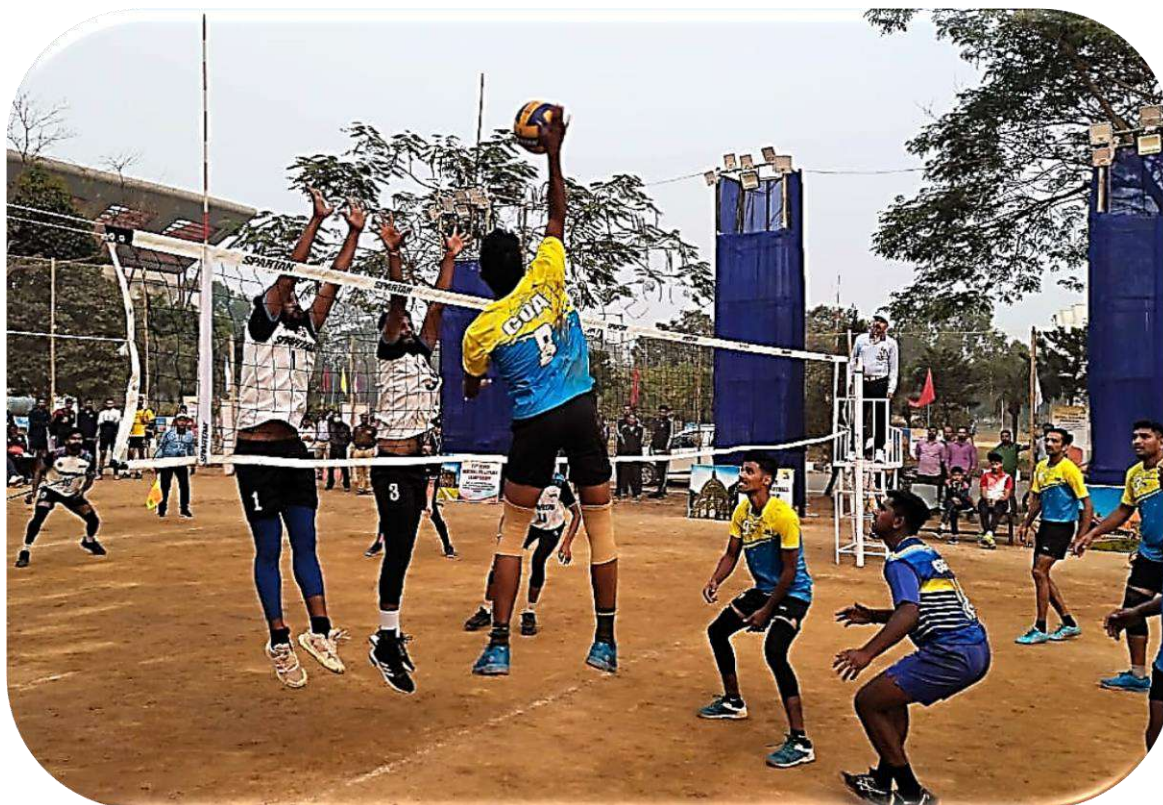
A moment of action in the match between Madhya Pradesh and Goa men teams