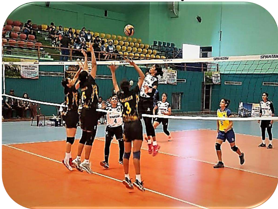
A moment of action in the match between Railways and Rajasthan women teams