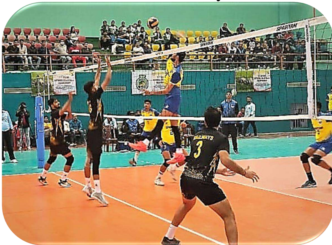
A moment of action in the match between Railways and Rajasthan men teams