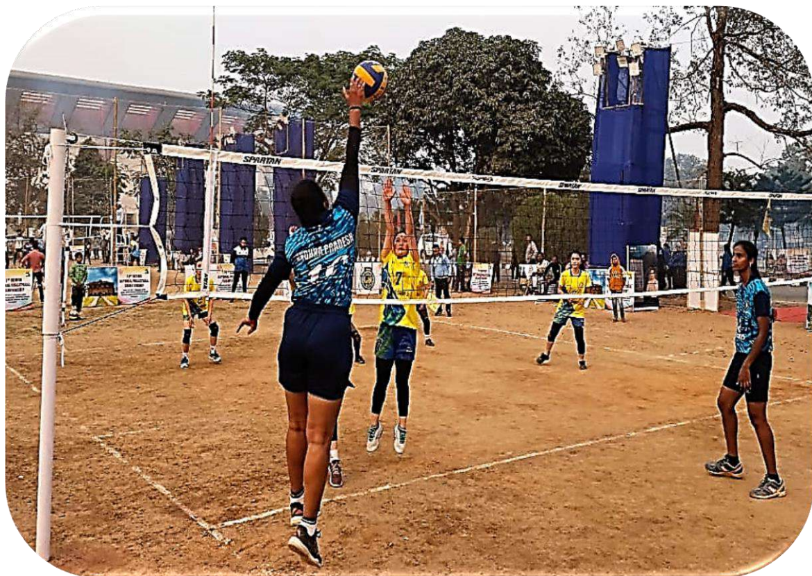
A moment of action in the match between Andhra Pradesh and UT Ladakh women teams